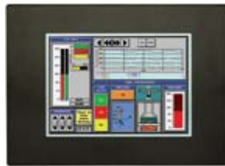
LTP - T15C-FS