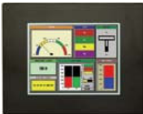
LTP - S8C-F