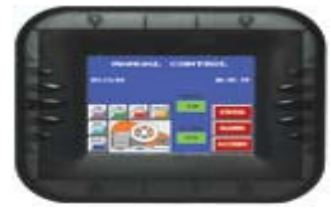
LTP - S6C-F