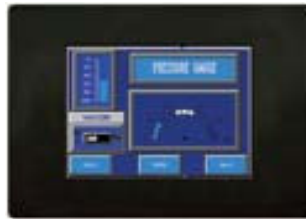
LTP - S6W-RS