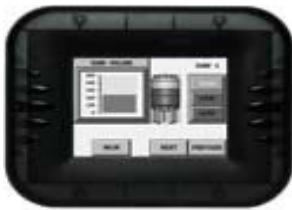
LTP - S6M-F